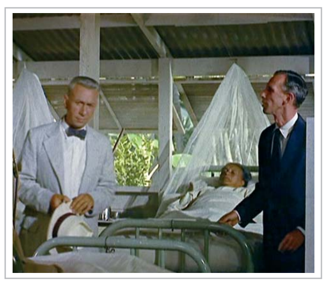
Figure 4. Miss Sadie Thompson (1953): "We need more penicillin and Bibles".

caine penicillin, mentioned in Not as a Stranger (1955), and oral penicillin as depicted in Tarzan's Greatest Adventures (1959) and Kolya (1996).