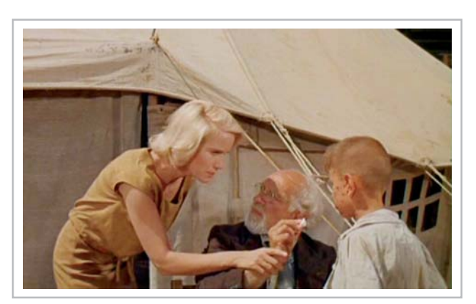
Figure 2. Exodus (1960): "Excuse me. This boy has a skin infection called impetigo. He needs sulphathiazole on those scabs".

treatment with salvarsan was long and not always effective. Furthermore, since it covers a long period of time, it provides proof on how the discovery of penicillin significantly changed the situation.