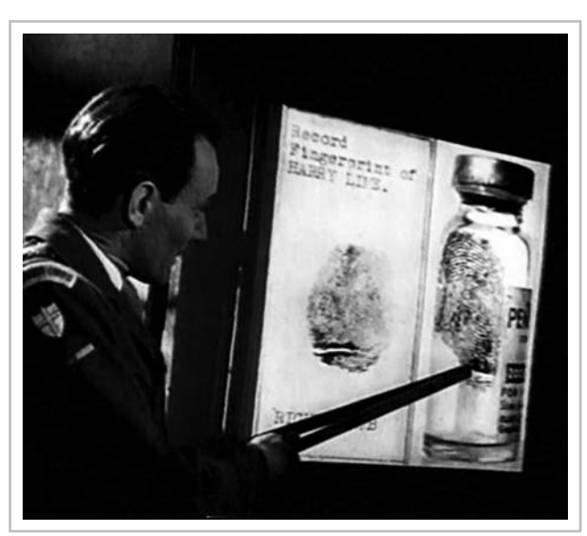
Figure 3. The Third Man (1949): diluted penicillin.

Penicillin is usually thought of as a sodium salt for parenteral administration. However, other salts, derivatives and presentations are also important as is the case with pro-