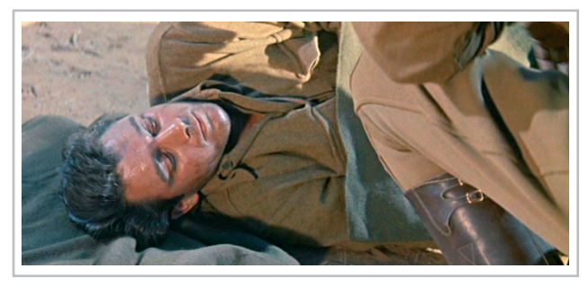
Figure 4. They Came to Cordura (1959): "What'll take the fever down?"/ "Quinine, rubbing alcohol and water".

During WWII, malaria vented its anger on the soldiers who were fighting on fronts located in endemic zones, as is shown in Patton (1970), where we see how the illness dec-