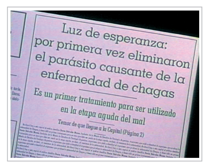
Figure 6. Casas de fuego (1995): First treatment of the acute phase of Chaqas disease.

On occasion, other types of antiprotozoan agents have appeared in the plot of some films. Vaginal metronidazole is regularly used by a prostitute in La vida alegre (1987) whenever she has a bout of trichomoniasis.