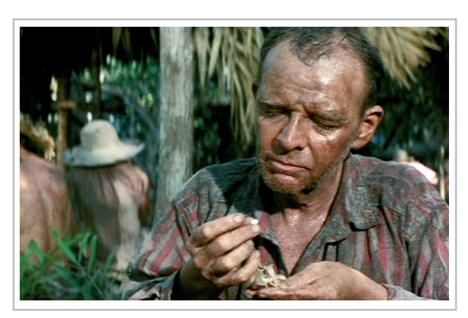
Figure 5. Papillon (1973): Prophylactic quinine.

imated the troops of Marshal Montgomery (Michael Bates) in Sicily. Quinine has thus been present as a therapeutic and prophylactic agent in many films whose plot takes place during this war. Some movies filmed during those times portray the perceptions about this alkaloid at the time. Some examples of films that portray the use of quinine in different places during the war include: Never So Few (1959) and Objective Burma (1945) in Burma; Cry 'Havoc' (1943), Bataan (1943) and The Eve of St. Mark (1944) in the Philippines; Paradise Road (1997) in Sumatra; Three Came Home (1950) in Borneo; and None But the Brave (1965) in the Pacific Islands. Quinine was not only used in Asian countries, but also in Europe as is mentioned in Captain Corelli's Mandolin (2001). In Bataan (1943), the need to take the effective prophylactic dose is emphasized.