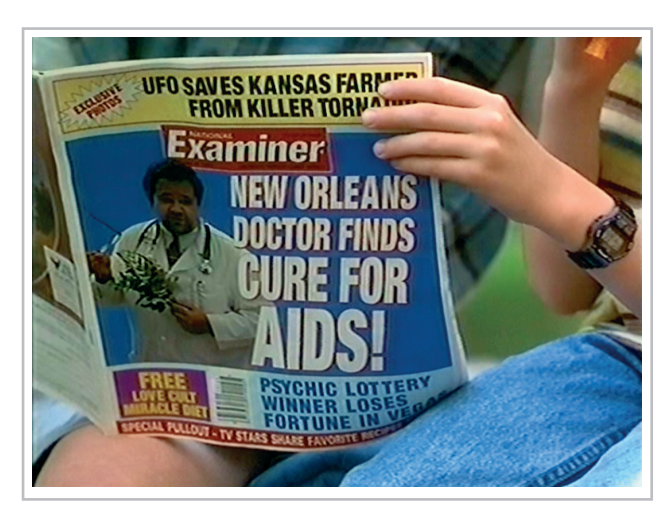
Figure 1. The Cure (1995): A sensationalist news story about an assumed cure for AIDS.

in real life, one of the plants tested proves to be toxic. The films also explores the false expectations that some people whose only interest lies in their own pockets may offer to patients with incurable diseases. In this case, a physician from New Orleans was brazenly offering a miraculous treatment for AIDS on the front page of a sensationalist newspaper (Fig. 1). Clearly contradicting the rules of good medical practice, he did not release any information about what the product contained; only he knew this.