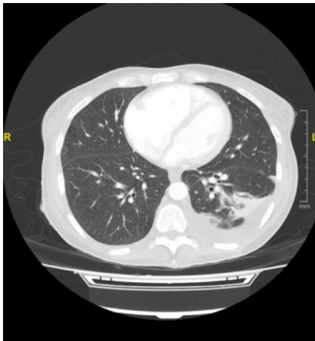
Figure 2 | Chest CT

Forty eight hours after admission the patient was hemodynamically stable, and afebrile. Antibiotic therapy was adjusted to only high dose cefotaxime, and the patient was transferred to the infectious diseases ward.